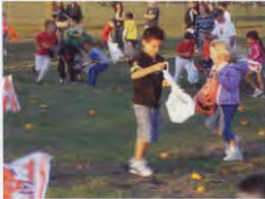
Children hunt for the prize pumpkin.

The Great Pumpkin will hide miniature and prize pumpkins for children ages 10 and under. The fun will continue with hayrides, games and refreshments. There is NO charge for this event.