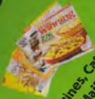
Magazines, Catalogs & Junk Mail