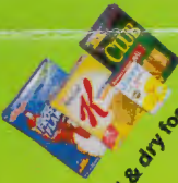
Cereal & dry food boxes