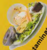
food contaminated paper