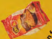
Frozen food bags