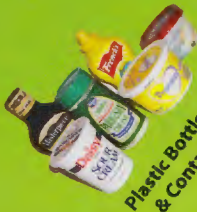
Plastic Bottles & Containers (#1 - #7)