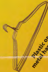
Plastic or metal hangers