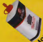
Hazardous or toxic