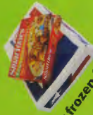
Paper or frozen food boxes